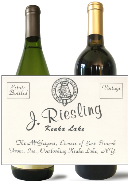
1976 (home wine making)