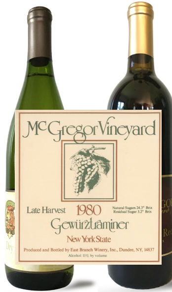
1980 (first vintage)